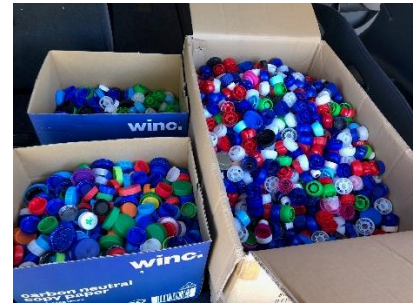
Our last trip to the recycling centre

Cans and plastic bottles for the Containers for Change are also recycled in the school.