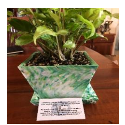
450 lids used to make this pot & tray

We recycled these bottle lids last week. These have been collected in Term 1 at LPS and we have another huge box filled already! Let's keep these out of landfill and have them turned into useful items.